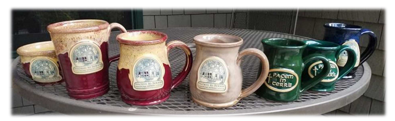
An assortment of Pacem mugs available for purchase as a keepsake of one's time spent on retreat.