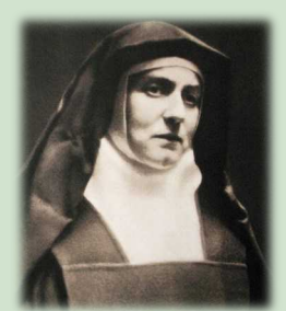
St. Teresa Benedicta

Stein wrote, " God is there in these moments of rest and can give us in a single instant exactly what we need. Then the rest of the day can take its course under the same effort and strain, perhaps, but in peace. And when night looks back and you see how fragmentary everything has been, and how much you planned that has gone undone, and all the reasons you have to be embarrassed and ashamed: just take everything exactly as it is, put it in God's hands and leave it to Him – really rest – and start the next day as a new life."