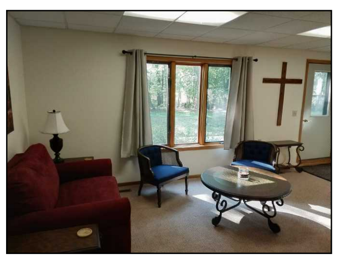
A view of the downstairs living room in St. Joseph House.

Guests have included pastors, priests, individuals, leadership of a women's book club, religious sisters, Church and school staffs. The house accommodates up to five individuals, has three bathrooms, a kitchen, dining area, living space, and a breezeway. We invite you to consider it as an option for your next day-long or overnight small group gathering.